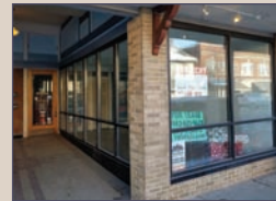
30 East Main 1,439 Sq. Ft. • Rent: $700 Contact: 443-621-9628