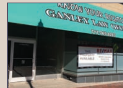
47 West Main 2,200 Sq. Ft. • Rent: $1450 Contact: 717-977-8100