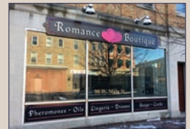
90 West Main 3,960 Sq. Ft. • Rent: Call for Info Contact: 443-621-9628 Includes loading dock, rear parking