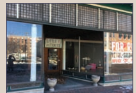
88 West Main #1: 1,000 Sq. Ft. • Rent: $700 #2: 1,000 Sq. Ft. • Rent: $700 Both sides: 2,000 sq. ft.; $1,200 Contact: 443-621-9628