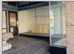
24 East Main 3,309 Sq. Ft. • Rent: Call for Info Contact: 443-621-9628