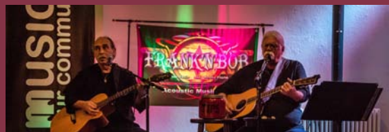
Live Music Fridays