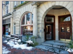
4 East Main 1,500 Sq. Ft. • Rent: $1000 Contact: 443-487-3705