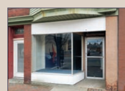
30 West Main 925 Sq. Ft. • Rent: Call for Info Contact: 301-606-1074