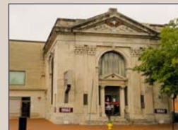
12 West Main 5,000 Sq. Ft. • Rent: Call for Info Contact: 717-404-6217 Lobby: 77 x 34 ft. New bathrooms, bar, heating system and small kitchen.