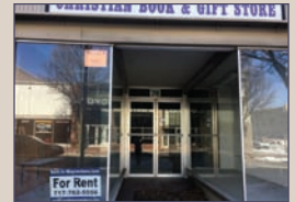
78 West Main 900 Sq. Ft. • Rent: Call for Info Contact: 717-977-9376