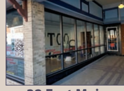
32 East Main 2,150 Sq. Ft. • Rent: $800 Contact: 443-621-9628