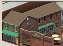
21 East Main 2,000–2,500 Sq. Ft. • Call for Info Contact: 717-762-0397 Great location next to downtown park. Perfect for brew pub.