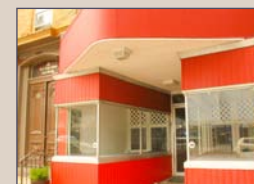
70 West Main 1,100 Sq. Ft. • Rent: $600 Contact: 717-729-1786