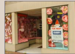
24 West Main 3,000 Sq. Ft. • Rent: $750 Contact: 717-762-7111