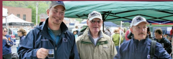
Beer, Wine & Cider Festival